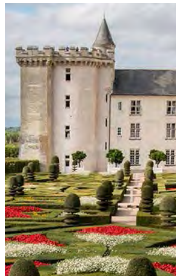
The castle of Villandry