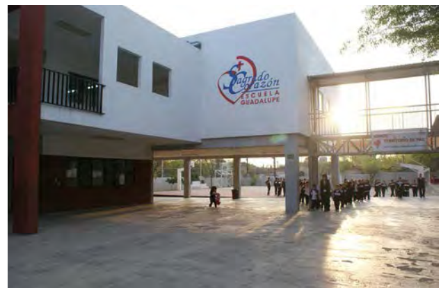
The Sacred Heart School in Mexico

. Welcoming new alumni. We are seeking to have a common passport at national level that identifies us as alumni of one of the Sacred Heart schools in Mexico. This initiative is already underway in some cities.