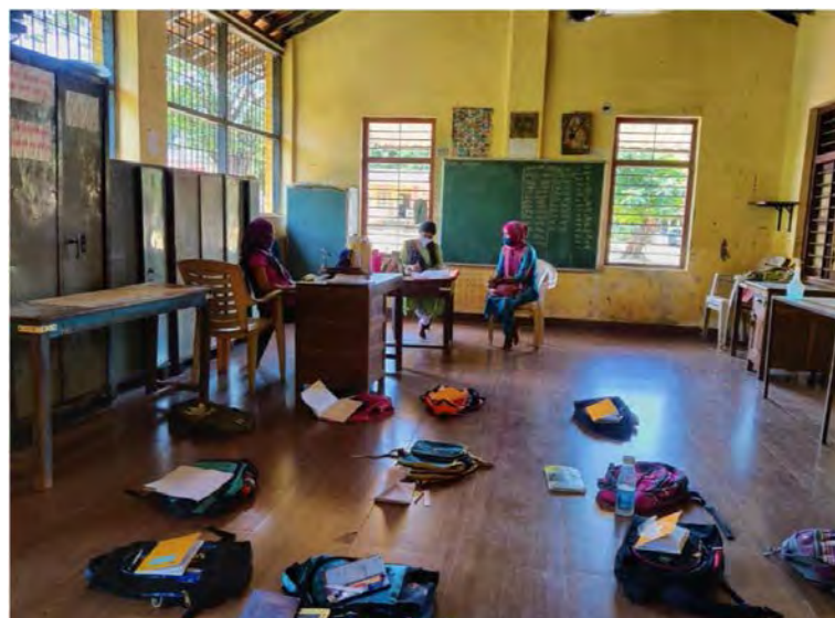
The new Normal with 10 students