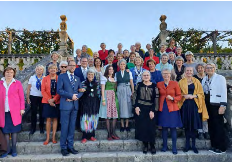
The group of participants at the Tours Congress