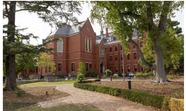
Burke Road (Glen Iris)