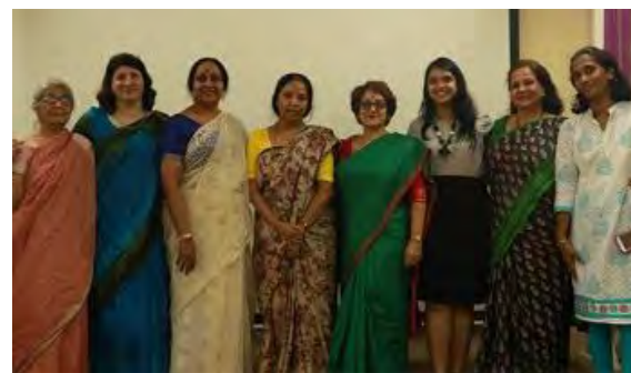
Annual General Meeting, 2018