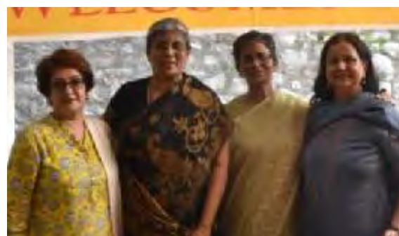
Coffee and Cake, on 3rd August, 2018