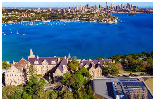
Kincoppal Rose Bay (Sydney)