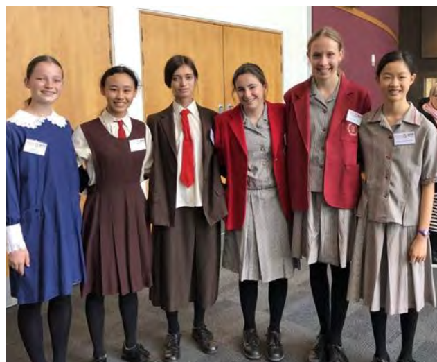
Uniforms in the past, and today

Our committee is made up of 13 dedicated and passionate women, we are thrilled to recently welcome two new members. Our annual A.G.M. is to be held in April 2020